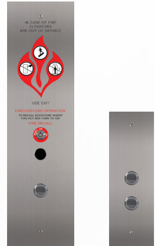
Hall Terminals with and without Fire Service