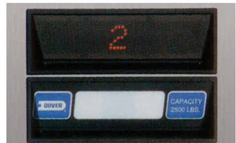
Before Impulse+ retrofit