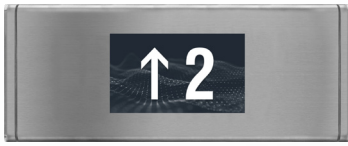
Hall Position Indicators with and without arrows. Standard and custom graphics shown.