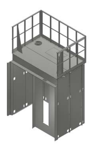
Front Right View