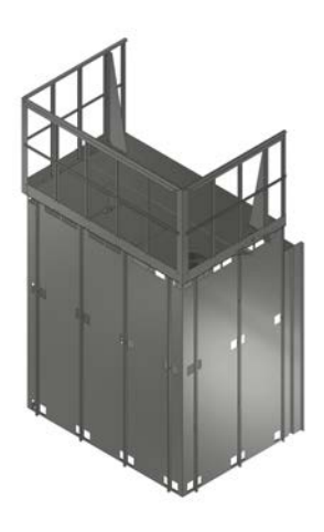
Rear Left View